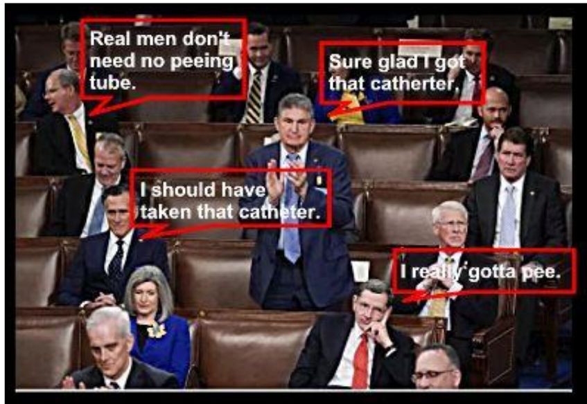
The Grand Master was in rare form. He had his act down pat.