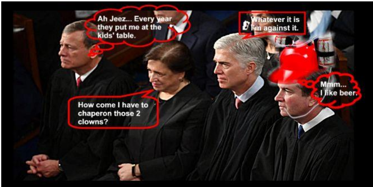
Much was said about Nancy Pelosi's ill-timed standing up when everyone else remained seated. But this is fake outrage. We've all been there.